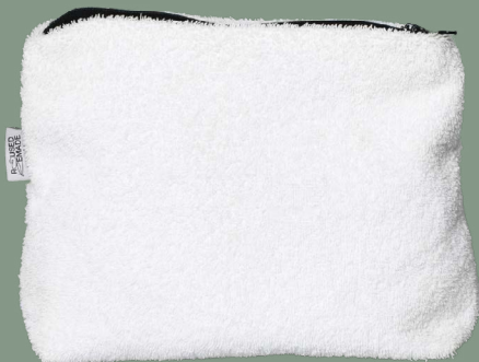
Toiletry Bag Small