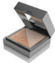
LOVESTRUCK / DESTINY