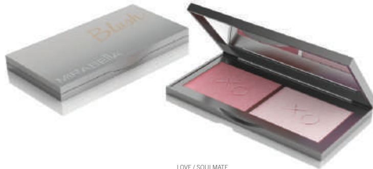
LOVE / SOULMATE

These easily blendable, mineral-based pressed powders add dimension to the face and can be worn alone or layered to create a variety of looks. Beautifully blended color combinations provide a soft, incredibly flattering glow to the skin and work to sculpt and define features with bronzing and illuminating powders. Available in matte and shimmer finishes.