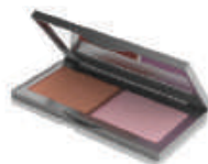
BELOVED / DARLING