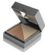
MATTE HUGS / KISSES