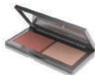
SWEATHEART / BABE