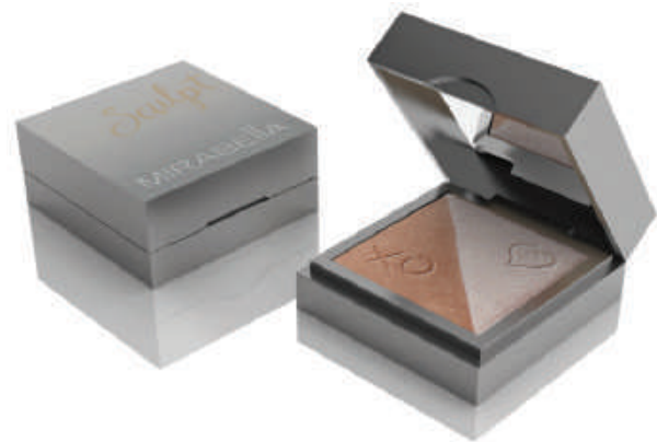
FATE / SERENDIPITY